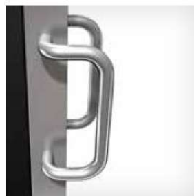
Offset handle with concealed attachments. Height 300 mm, \varnothing 30 mm. Aluminum.