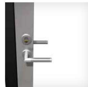
Lever handle for inner door Lever handle, knob, rosette and cylinder rosette with modular profile. Width 137 mm, \varnothing 21 mm.