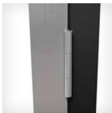
Lap butt hinge 14072, 14094 H_{\max} = 2400\text{mm} L_{\max} = 1250\text{mm} - cannot be used in the system SAPA 2086 Plus and Extreme.