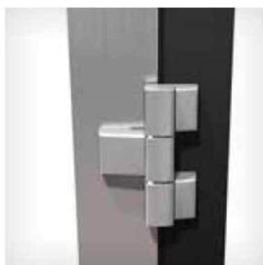
Universal hinge Dr Hahn - 14090, 14091, 14092.