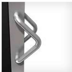
Triangular handle with concealed attachments. Height 300 mm, \varnothing 30 mm. Aluminum.