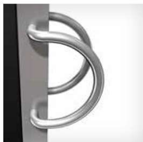
Semicircular handle with concealed attachments. Height 300 mm, \varnothing 30 mm. Aluminum or stainless steel.