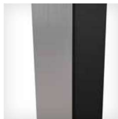
Concealed hinge 14059, 14065